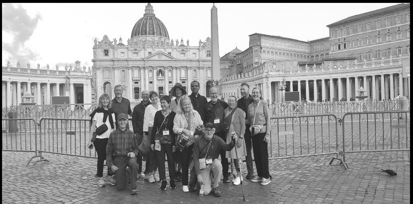
The Shrines of Italy Pilgrimage group on Wednesday, May 8th, after walking from the hotel at 5:30 a.m. to St. Peter's Square—where at that hour it was almost empty of people.

To Schedule a Mass Intention, Please call the Parish Office—(541) 382-3631—by 5 p.m. on Friday, 8 days prior to the next Parish Bulletin publication.