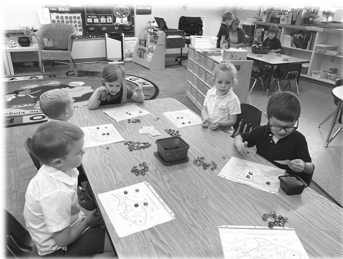
Pre-K uses an "ocean life" theme to increase letter-recognition skills.