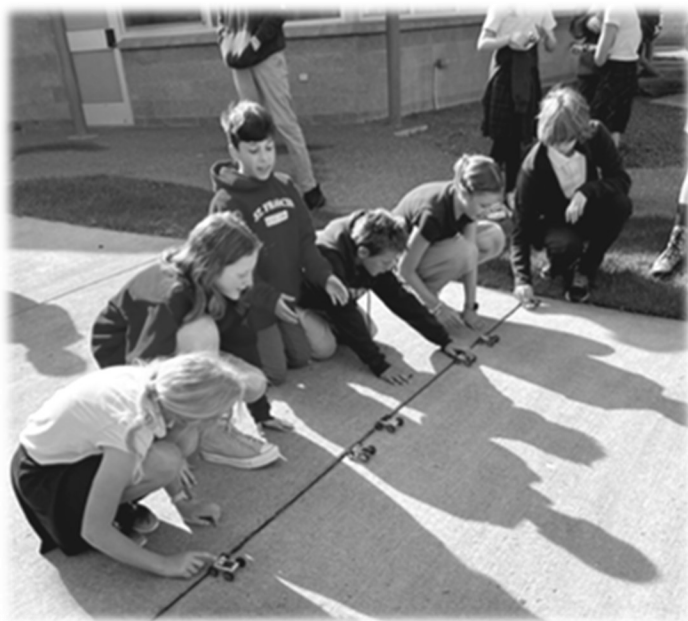
Sixth Graders exploring solar power by building and running mini-solar cars.

Tuition payments can require significant sacrifices for some families, and we appreciate your help to provide access to a Catholic Education to those who need the most help.