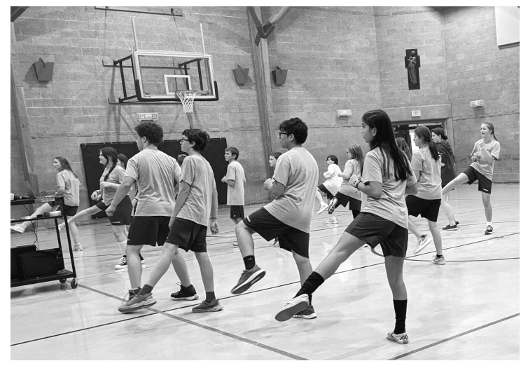
Active, collaborative learning from preschool to eighth grade.