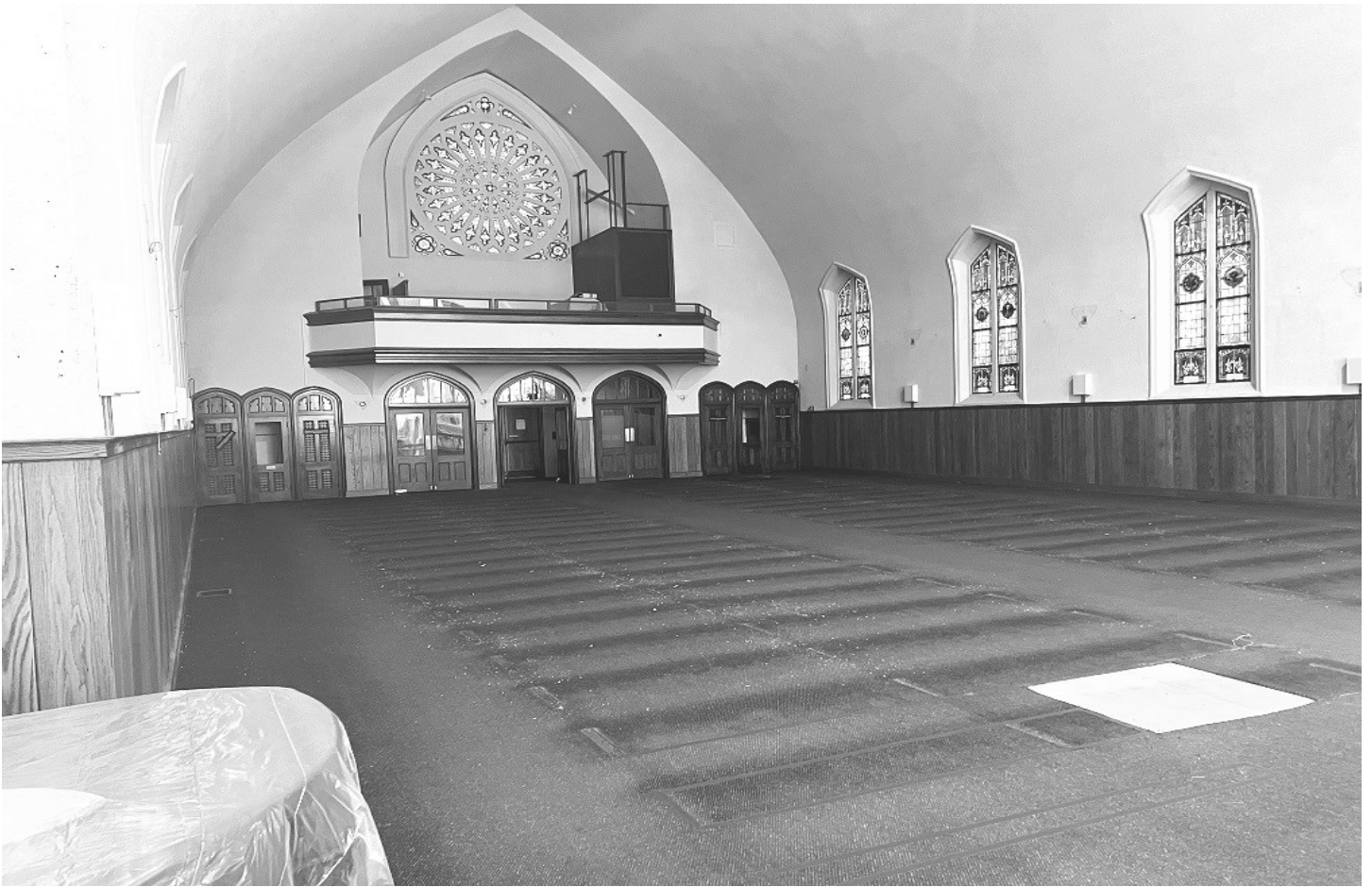
All pews were removed from the Historic Church and sent to Wisconsin for refinishing.