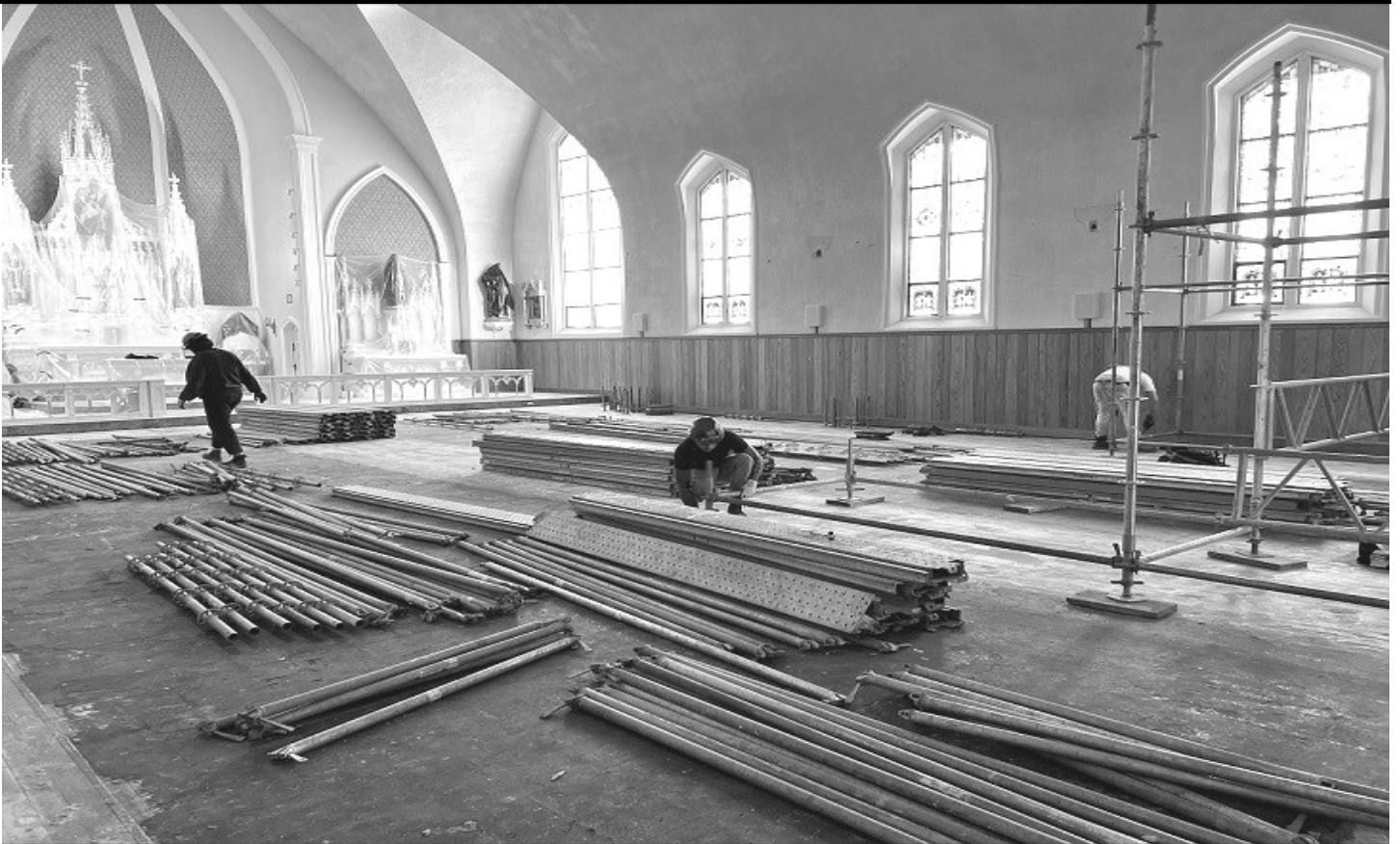
The scaffolding will be installed this week in preparation for cleaning, painting and skim coating.